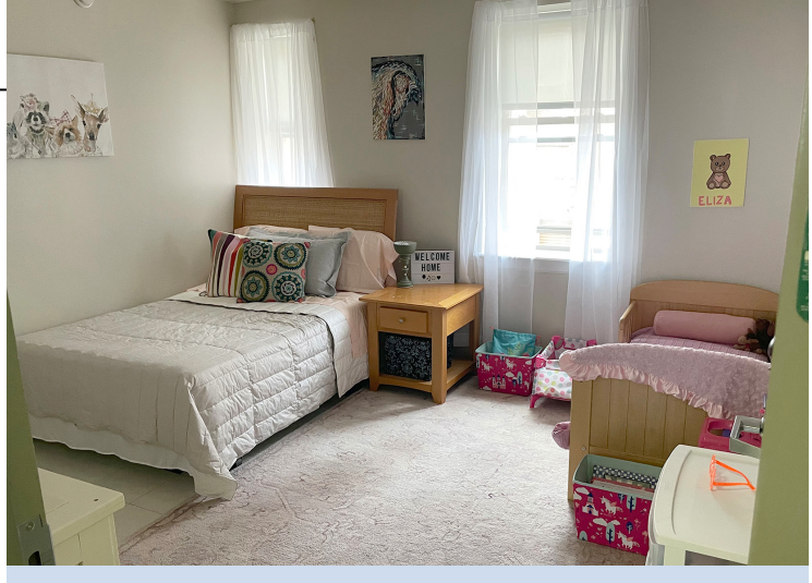
One of the eight redesigned bedrooms at the Parenting with Purpose program.