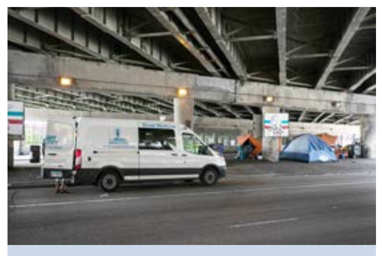
The Street Medicine Team visits an encampment in Chicago. The increasing cost of housing is putting more community members at risk of losing their homes.

renters, are hard to come by. With few places to turn, some may have to enter the shelter system, try to survive on the streets, or "double up"—stay temporarily in other people's