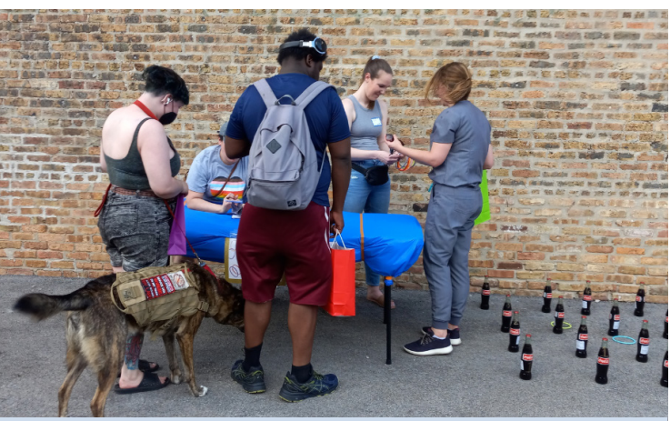
Youth Programs participants join in the fun at the Health Fair, an event hosted by The Night Ministry and Rush University medical students.

Because The Night Ministry has program facilities in several areas of the city, staff provided many Health Fair attendees with transportation. As the waves of young people arrived, each participant received a drawstring backpack filled with hygiene items along with a list of resources relevant to the event's topics. Guests were also given a food ticket which could be exchanged for a meal provided by The Night Ministry and a "health passport."