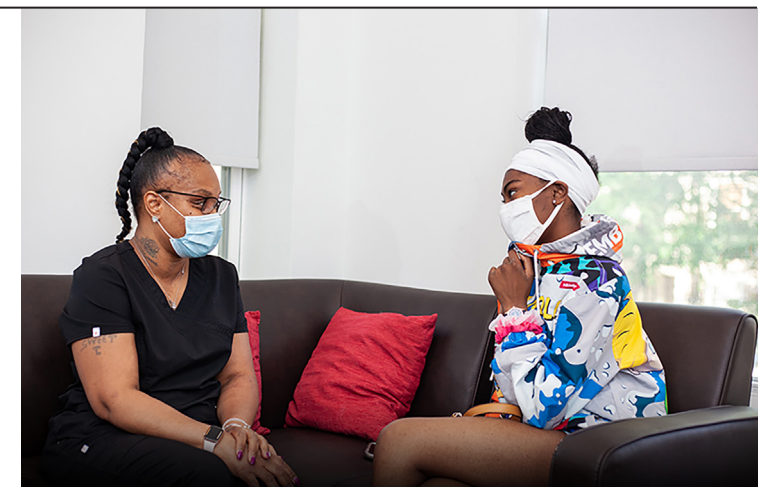
The Night Ministry is a Chicago-based organization whose mission is to provide human connection, housing support, and health care to those who are unhoused or experiencing poverty. With an open heart, we compassionately accept each individual as they are and work alongside them to advocate for their immediate physical, emotional, and social needs while affirming our shared humanity.

The Night Ministry's previous mission statement referred to those whom we serve as "experiencing homelessness." The word "homelessness" has been deliberately replaced with "unhoused,"