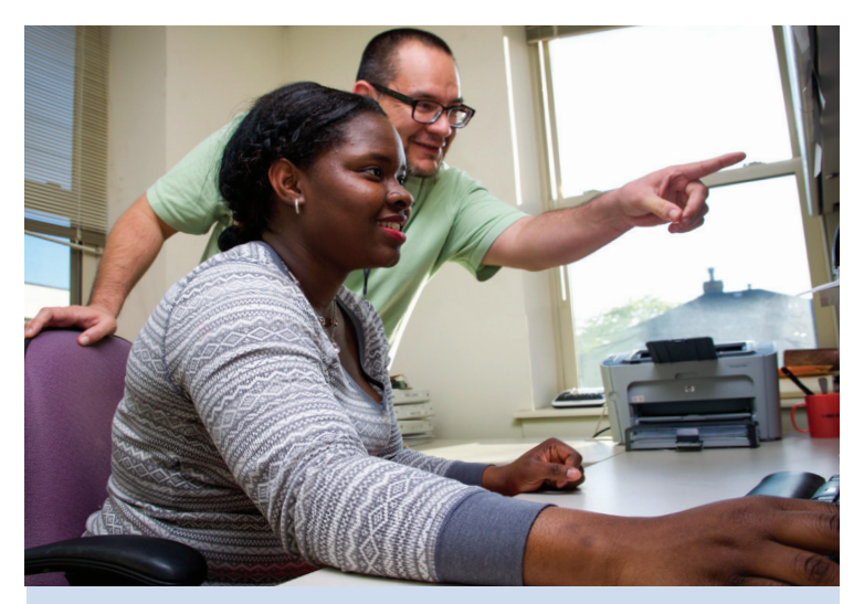
One of the goals included in The Night Ministry's new strategic plan is to deepen and widen programming offered by its Youth Programs and Outreach and Health Ministry Program.

A t its meeting in December, The Night Ministry's Board of Directors approved Serving in the Next Decade , The Night