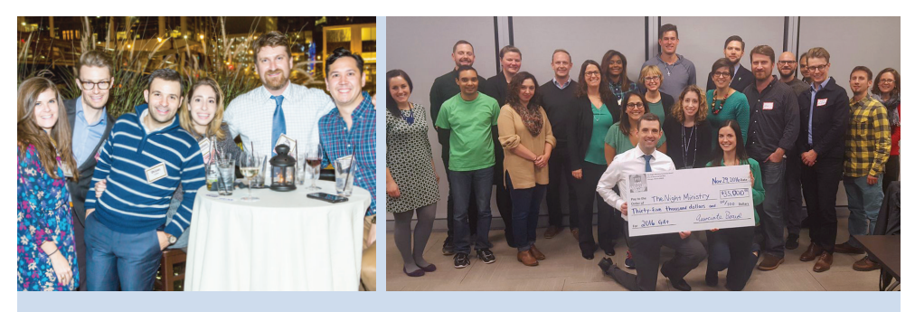
After raising a record-breaking $40,000 at the annual Night Lights gala, held on November 10, 2016 at River Roast, the Associate Board was able to make its largest-ever gift to support the mission and programs of The Night Ministry.

The Associate Board (AB) supports the overall mission and activities of The Night Ministry. Acting as ambassadors of the agency, AB members engage the community through volunteering, fundraising, networking, and advocacy opportunities targeted towards young professionals. To join the AB or to receive information about membership, please email associateboard.tnm@gmail.com. \diamond