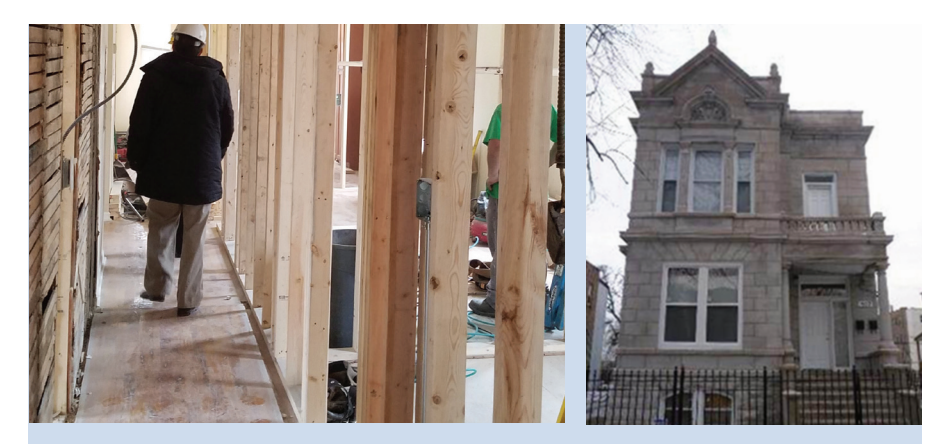
Construction is underway at Phoenix Hall in North Lawndale. Once construction is completed, Phoenix Hall will provide housing for up to eight North Lawndale College Prep students experiencing homelessness.

The Night Ministry's fifth housing program for youth experiencing homelessness will be named Phoenix Hall when it opens this spring.